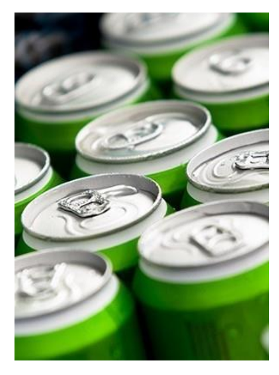
Can coating for beverage packaging